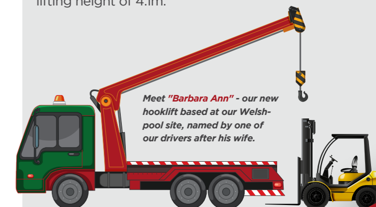
Meet "Barbara Ann" - our new hooklift based at our Welsh-pool site, named by one of our drivers after his wife.

We also have a new Hyster 3.0R forklift truck with rotation clamps to add to our fleet at Deeside. It has a lifting height of 4.1m, a turning radius of 2.277m and a lifting height of 4.1m.